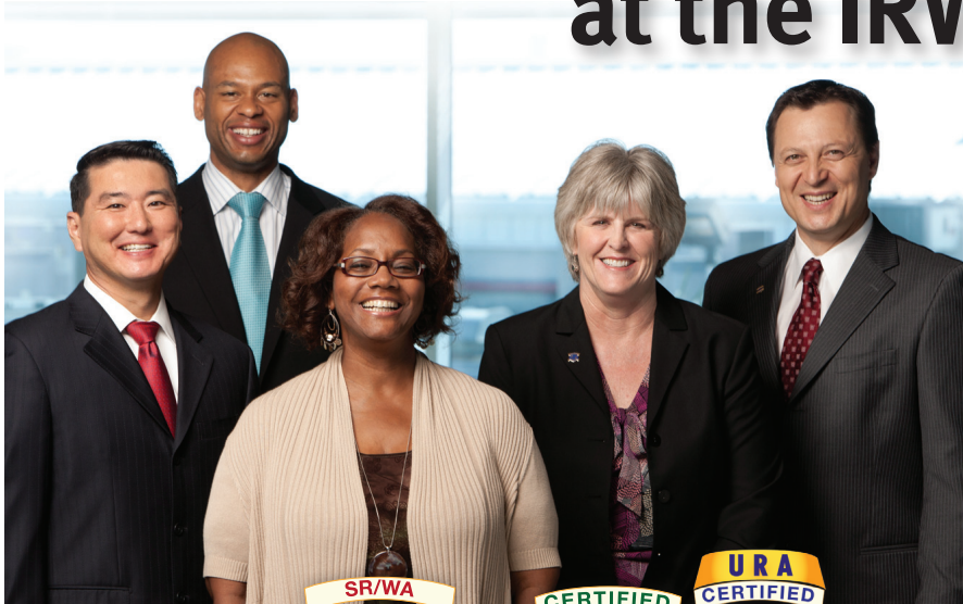
Actual IRWA members

The SR/WA is the highest right of way designation and reflects a commitment to professional growth and development.